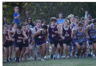
Paladin XC Team at starting line