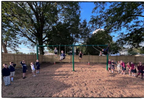
2nd graders testing out new swing set during P.E.